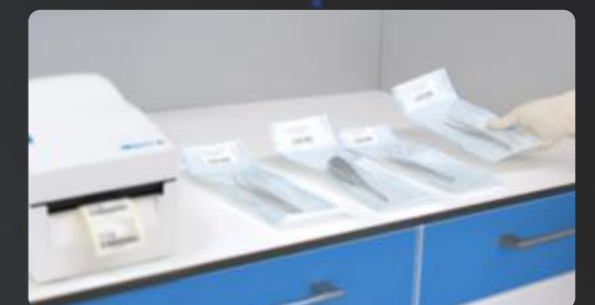
✓ Labeling with MELA print 80