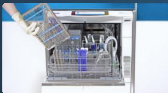
✓ Cleaning & disinfection with MELAt herm

Unique as a product, unbeatable as a system: