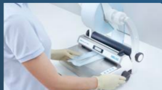
✓ Packaging with MELA seal or MELA store