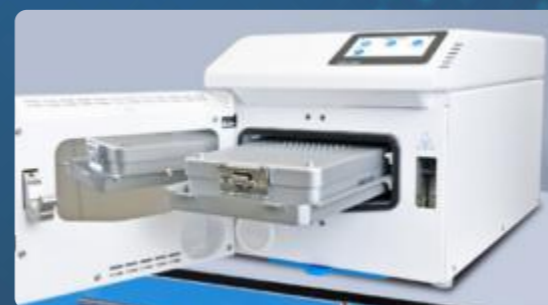
✓ Steam sterilization with Vacuclave 105 / 305