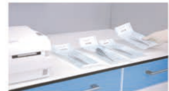
✓ Marking with MELAprint® 80