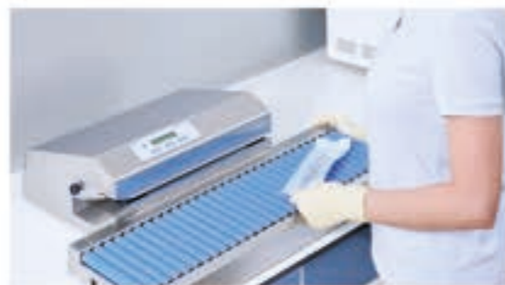
✓ Packaging with MELAseal® or MELAstore®