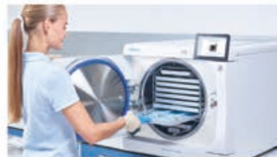
✓ Steam sterilization with Vacuclave® 550