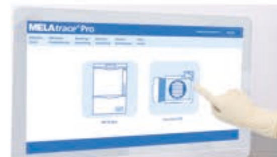
✓ Documentation & approval with MELAtrace®