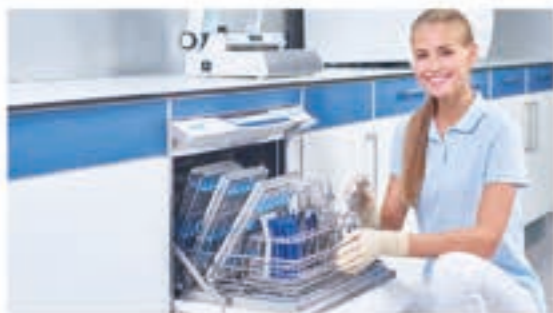
✓ Cleaning & disinfection with MELAtherm®

Vacuclave® 550 – Unique as a product, unbeatable in a system: